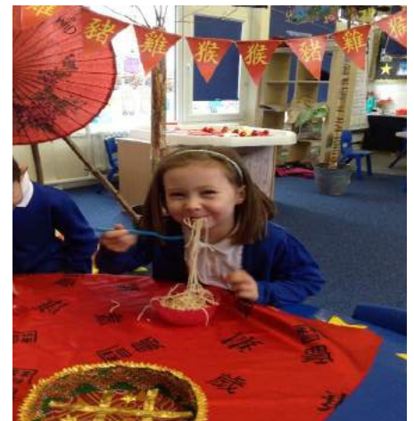
Yummy Chinese Food

Once they were built and decorated, we took them to the local park to fly! We used our Maths skills to measure how far they flew and we decided which rockets would be best for Bob and Barry. Year 2