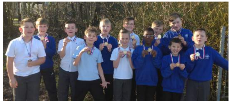
Proud medal winners

Performing superbly, the Sharps Copse football team competed in the Havant Schools Year 6 League and were awarded bronze medals for 3rd place. Their consistent effort and hard work meant that the team didn't lose a single game and are now competing in their next league.