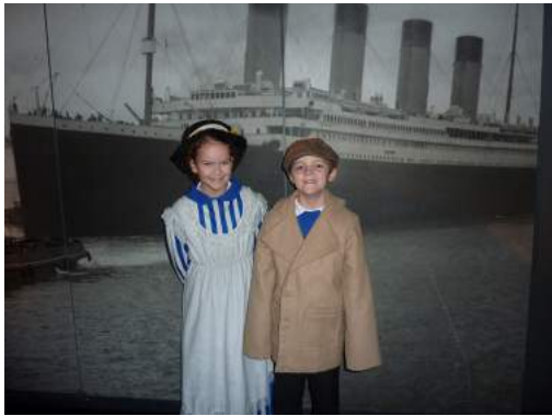
Dressing up Titanic Style

An exciting opportunity to expand Year 3/4's wealth of knowledge on their current topic of 'Titanic' came about on the 27th January, when they visited the Sea City Museum in Southampton. With activities such as guided tours, workshops, dressing up and the handling of authentic artefacts, they experienced everything from its maiden voyage to its sinking. Shannon Conway reported: "I learnt how the tragedy influenced the safety of modern ships." Upon their return, all wrote incredibly entertaining fact filled stories.