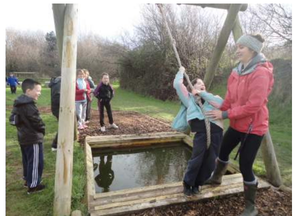
We made it without getting wet

In January, Year 4 held its annual residential at Stubbington Study Centre. Taking part in exciting outdoor activities and scenarios such as Shelter building, beach combing and everyone's favourite EARTHQUAKE! Some people did actually go in at the deep end! Others were just wet behind the ears, but all came away having had a great experience.