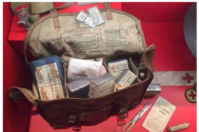
War Time First Aid Kit