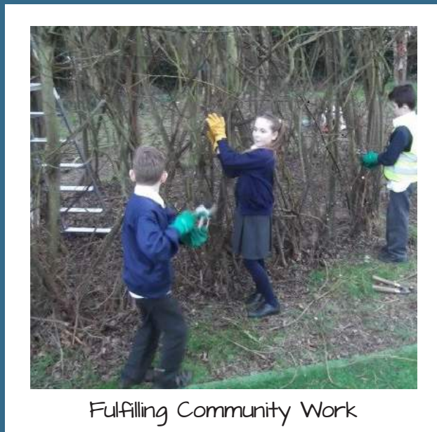
Fulfilling Community Work