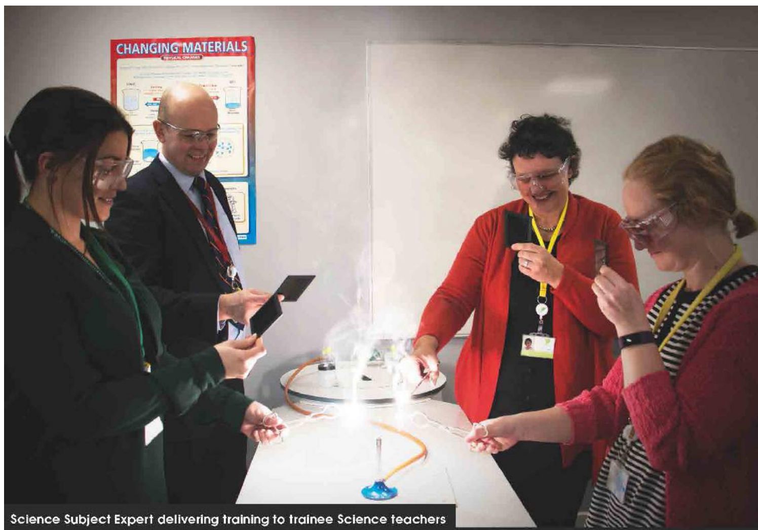
Science Subject Expert delivering training to trainee Science teachers