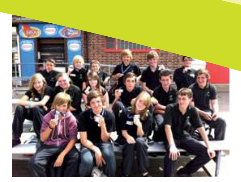
Park's medal winners at the Havant Rotary Games

Park students performed fantastically and came away with an array of medals.