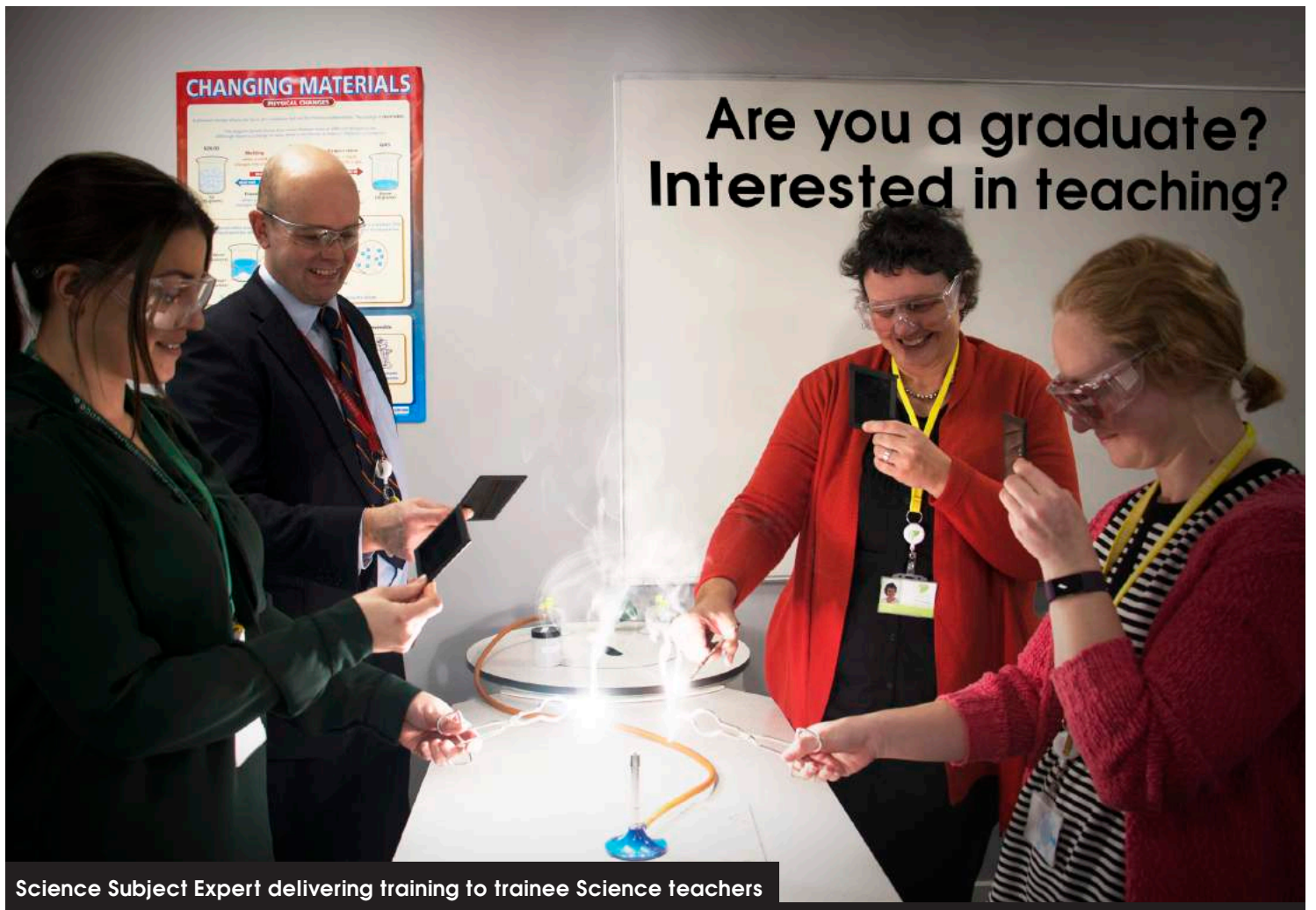
Science Subject Expert delivering training to trainee Science teachers