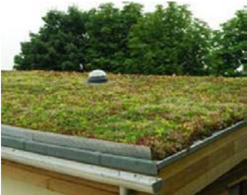
An example of a sedum roof

The building will have a Sedum 'green' roof to slow down rainwater run off and increase the biodiversity of the site. An air source heat pump will be used to boost heating in the winter and cooling in the summer.