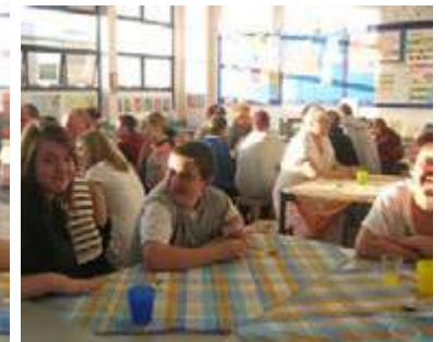
Family, friends and young chefs at the successful 'Let's Get Cooking' event