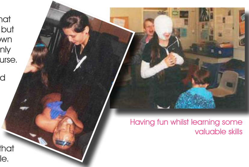
Having fun whilst learning some valuable skills

The children practised CPR, bandaging, scene and shock management, protocols for contacting medical emergency services and practised scenarios to test their knowledge. The course was designed to be fun and the students most certainly enjoyed it. However the fun did not prevent the strong message being delivered about how important these skills are - a message that was most certainly embraced by the young people.