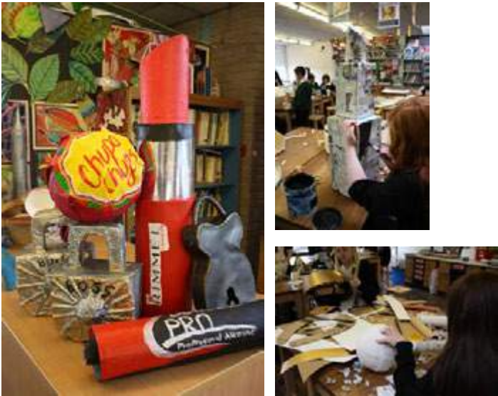
Everyday objects were the Inspiration for Year 9 art

They have constructed everything from a drawing pin, lipstick and padlock to a lollipop and have had to select and apply the right materials to create the illusion of realism.