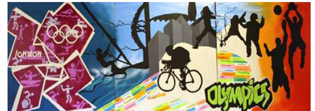
Students mastered new techniques to produce an attention-grabbing mural