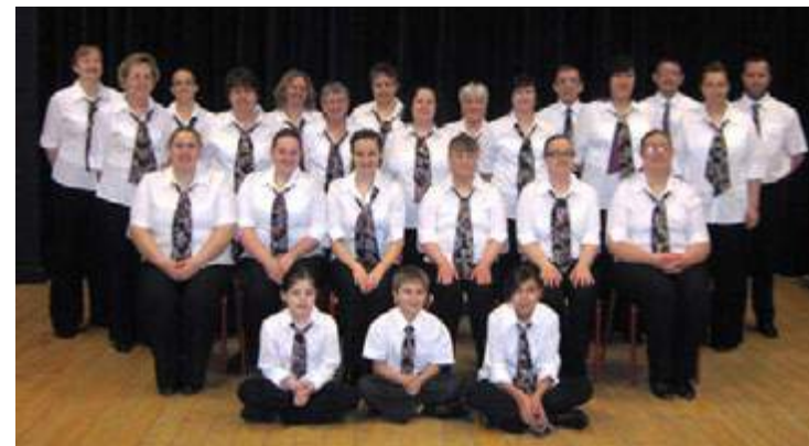
Leigh Park Community Choir

The Leigh Park Community Choir, which practices each Thursday at Park Community School, were proud winners of the Stella Halcro Memorial Cup.