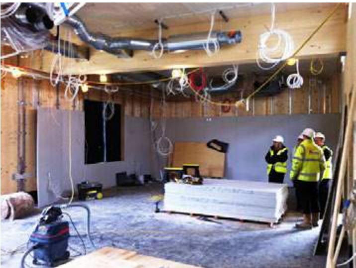
Our Community Building is nearing completion

We are also building the capacity that we have to offer activities and services to our community. This means more activities for students out of school hours from next September and classes and training for adults. If you have a suggestion for something that you would like to see us do, please let me or Susan Parish, who leads our community department, know.