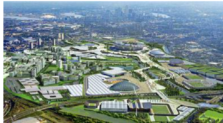
The Olympic site is ready for London 2012

Three lucky students (Bradley Biles, Rebecca Horne and Beth Stallard) got the opportunity to visit the London 2012 Olympic site. Our students were taken on tour with other students from the Federation schools. They had a detailed tour of the site and investigated the geography behind the Olympics and well as the environmental impact and legacy of the site.