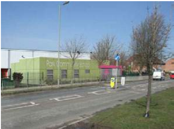
Artist's impression of the front of the building

Park Community Ventures plan to use the building for many activities such