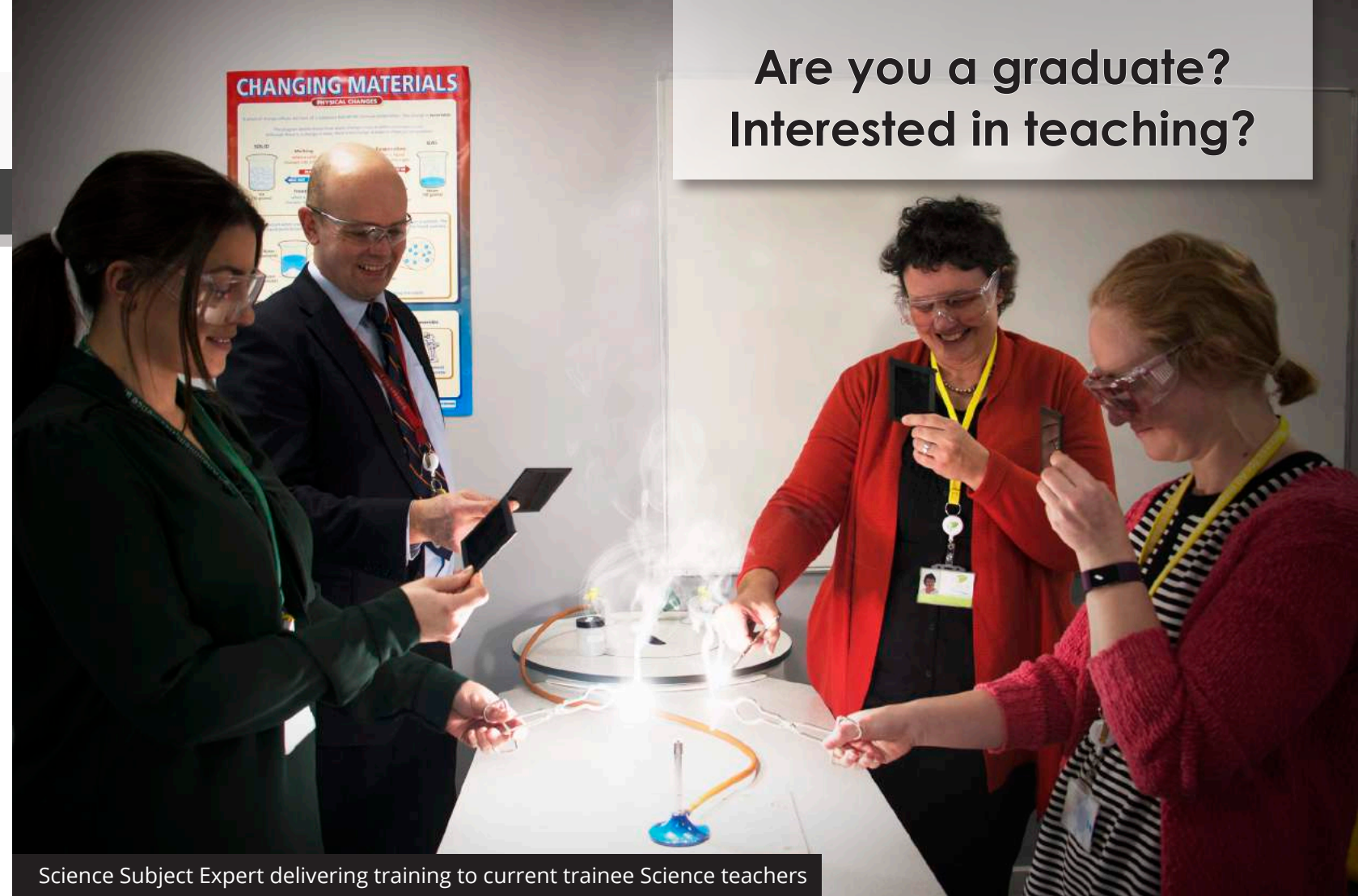
Science Subject Expert delivering training to current trainee Science teachers

Are you a graduate? Interested in teaching?