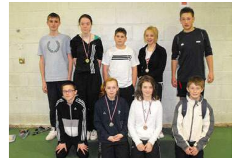
Park's successful table tennis teams