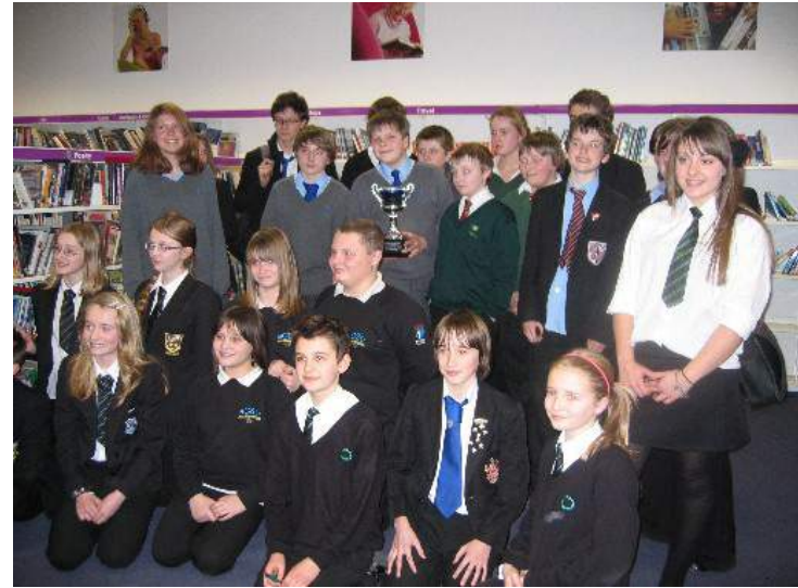
Park students have their eyes on the Literature Quiz trophy in 2011!

Despite a strong start, the Park team eventually finished a respectable 4th out of 8 – a great position considering this was the first time our school had ever taken part. Oaklands were the eventual winners but they will face strong competition next year as Park's team is determined to return and take the trophy.