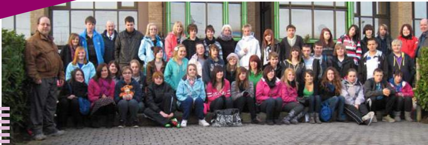
Students and staff in France

The following Tuesday we had a day together where we completed the Maths and IT sections of our work and had prizes for various aspects of the trip.