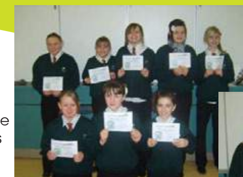
Above: Under 13 B team Right: League winners - Under 13 A team

The under 13 B and under 16 team also produced