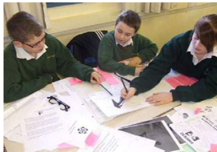
Using English and Science skills to solve the murder

In February, Year 8 took part in cross-curricular core days (known as C4 days). The two days involved students using their English and Science skills to solve a crime.