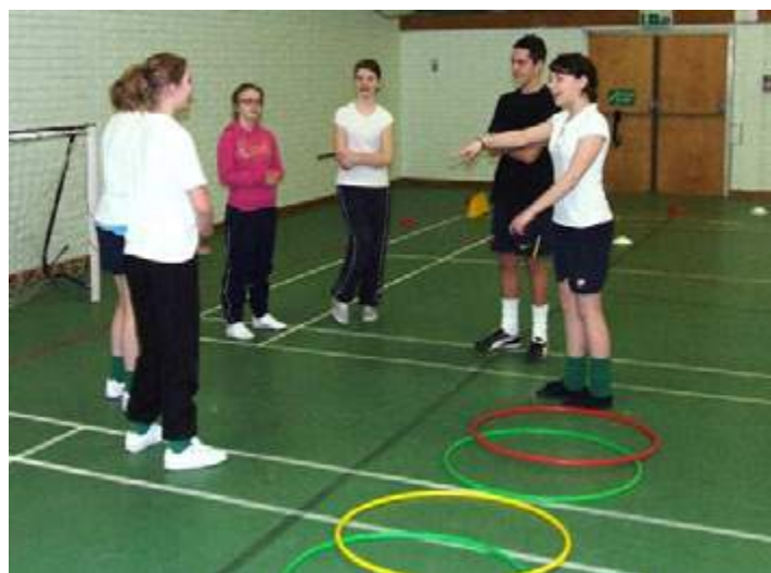
Park's Young Leaders prepare for their next event

Later in March seven of the Year 9 Sports Leaders went to Staunton Community Sports College for a sports festival for people with disabilities where they helped and demonstrated