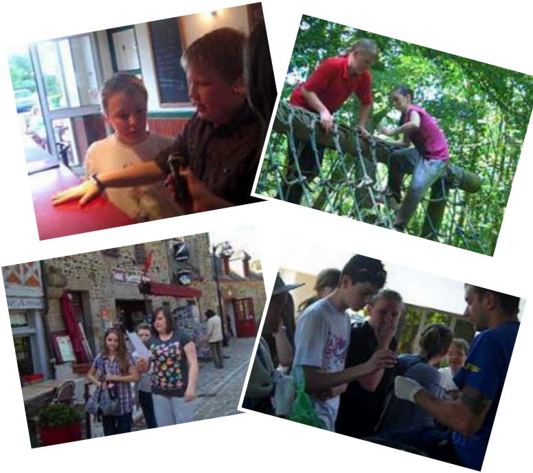
Communication, (snail) tasting and physical skills were all used on the activity trip!