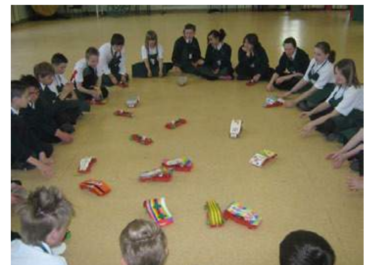
Year 7 Design and Technology students had great fun testing out the model cars they had constructed during their lessons!