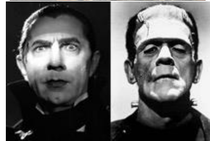
Romanticist and Gothic writers