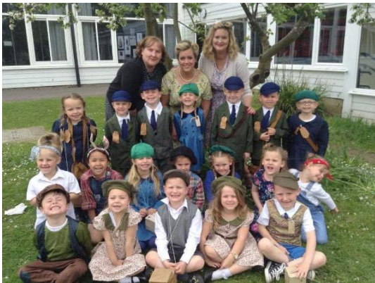
A fantastic opportunity