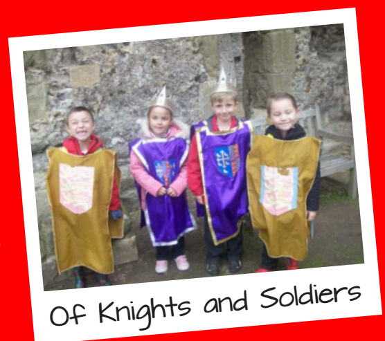
Of Knights and Soldiers

"I was dressed as a soldier, I had to try and fire the bow but it was really tricky, too hard".