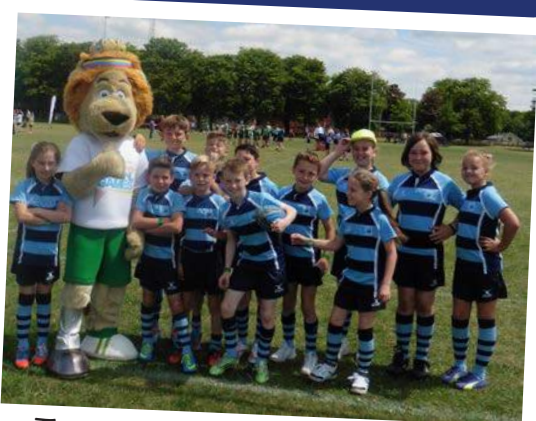
Tag Rugby - Hampshire School Games