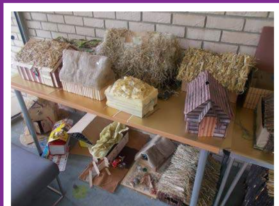
Year 4 Viking longhouse models