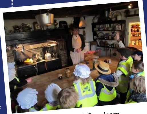
Victorian life trip

It has been an exciting 2014/15 for all year groups experiencing a range of trips and visitors; Year 1 visited Arundel Castle and the Manor Farm to learn about Victorian life (pictured right), Year 4 went to Portchester Castle while Year 5 enjoyed a Greek Theatre Workshop to help their topic on Ancient Greeks and Year 6 had a residential trip to Calshot and the whole year group were involved in the end of year production 'Oliver'!